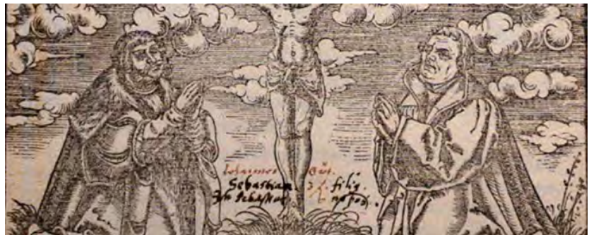
Martin Luther (right) often praised Friedrich the Wise (left) as an ideal ruler. Photo: Part of the title page of vol VI of the collected Latin works of Luther, Wittenberg 1580.