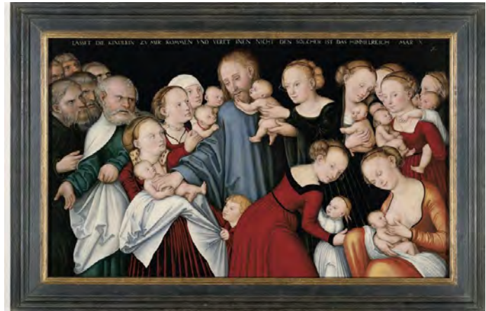
Lucas Cranach the Elder, Christ Blessing the Children