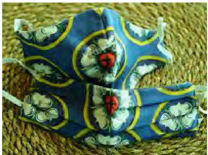
Nina Koefoeds' homemade face masks featuring Luther roses. In many ways, a contradiction in terms, but in other ways necessary